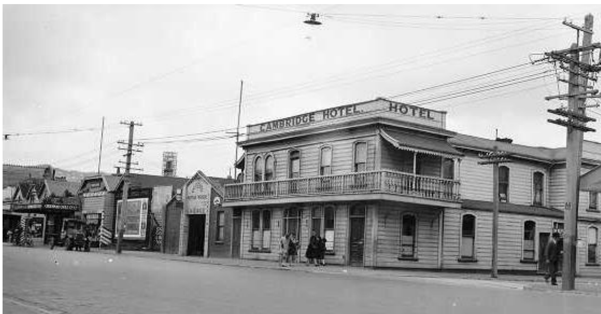
Cambridge Hotel, 1920