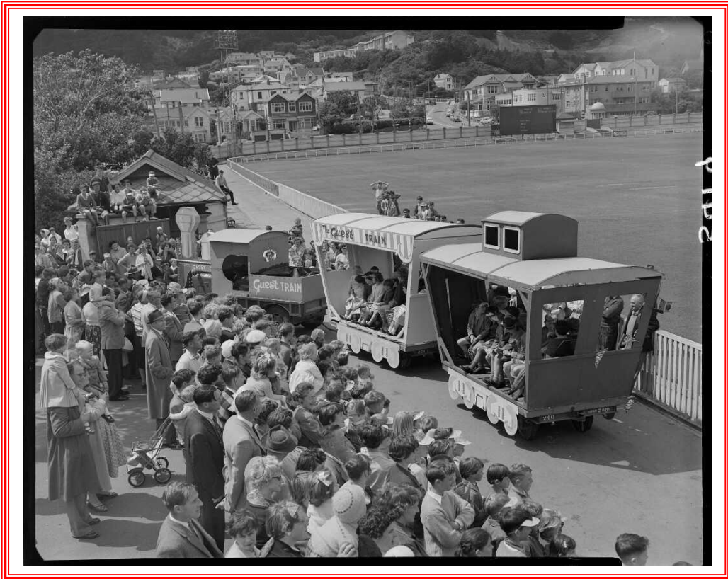
Christmas parade, Basin Reserve, 12/11/60 [ATL 1/2-212637-F]