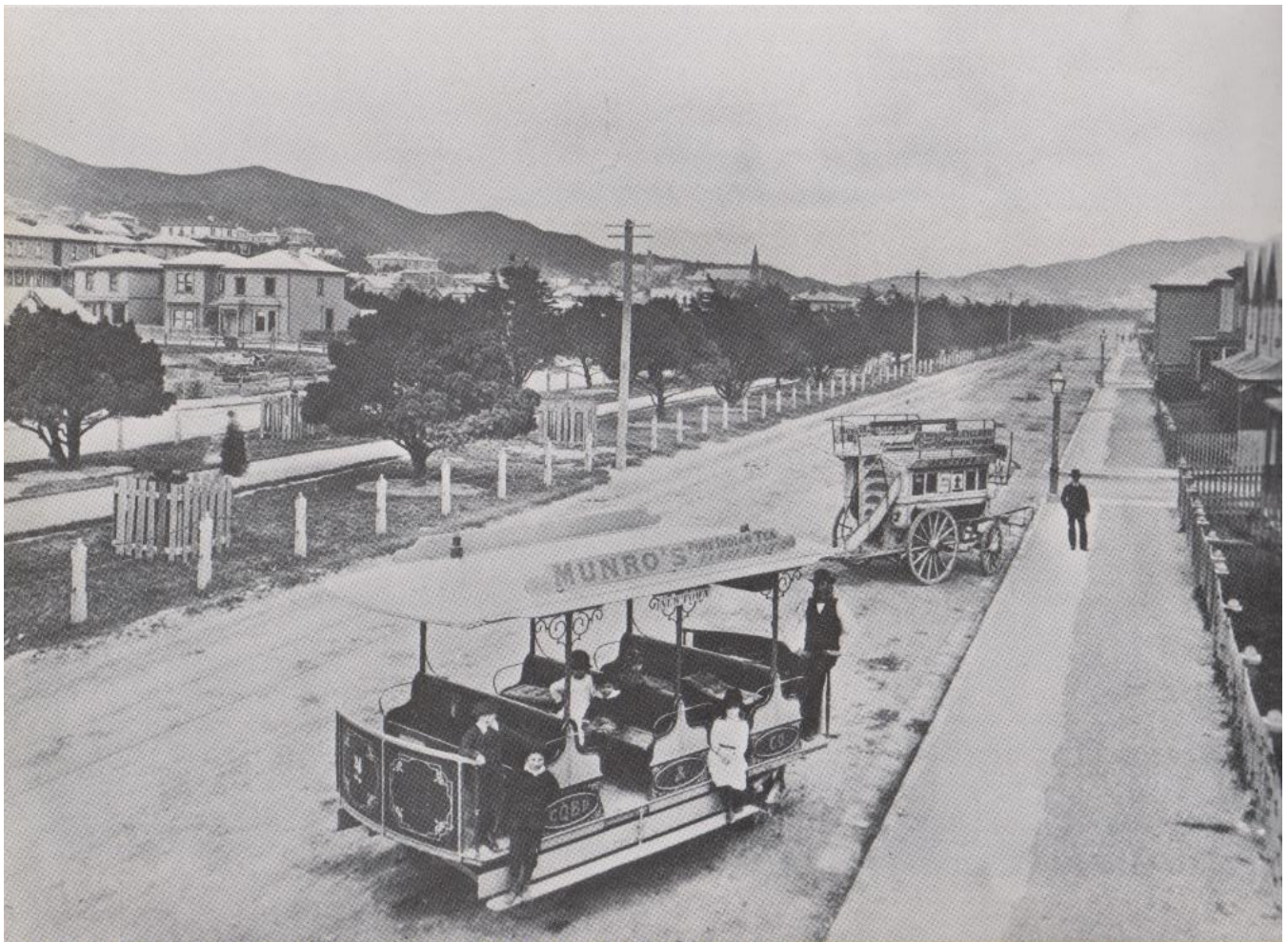
A view of Cambridge Terrace from the Cambridge Hotel's upstairs veranda c. 1890.

The current Cambridge Hotel has been serving patrons and guests since 1931. With the demolition of a number of Wellington's historic hotels, it is now one of the oldest in the central city and entertainment district. The hotel is Heritage New Zealand Listed (2/ Historic Place 1344).